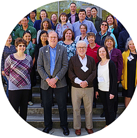
FACES OF WRCEFS

spotlights, featuring our leadership team and partners. The goal of Faces of WRCEFS is to highlight the diverse expertise of our regional leaders by showcasing their stories and work related to the Food Safety Modernization Act.