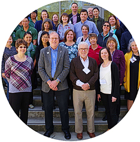
ACES OF WRCEFS

work related to the Food Safety Modernization Act.