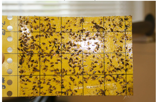
BLH yellow sticky card