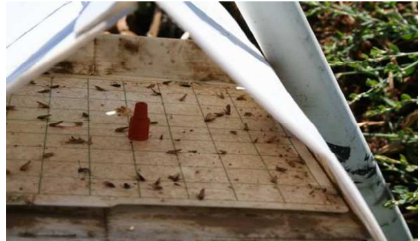
PTW delta trap, noticed the septa in the center of the liner containing the pheromone that attracts PTW males