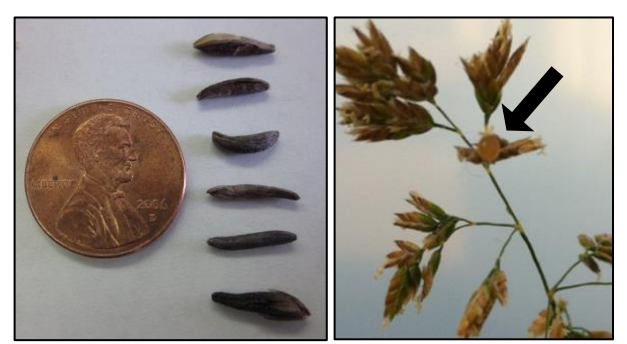
Figure 2. Ergot sclerotia (left) and honeydew (right, indicated by an arrow).