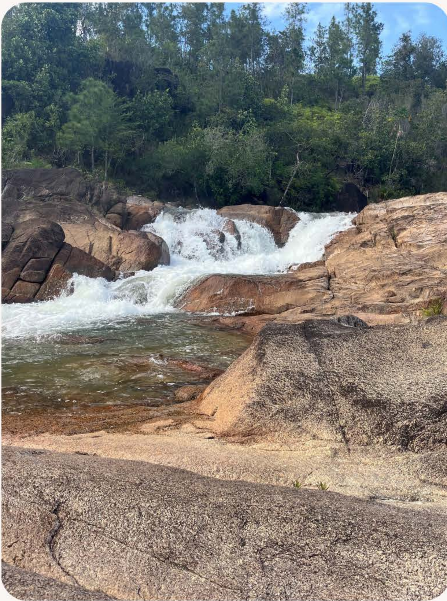
The river near our field house where we bathed and did laundry