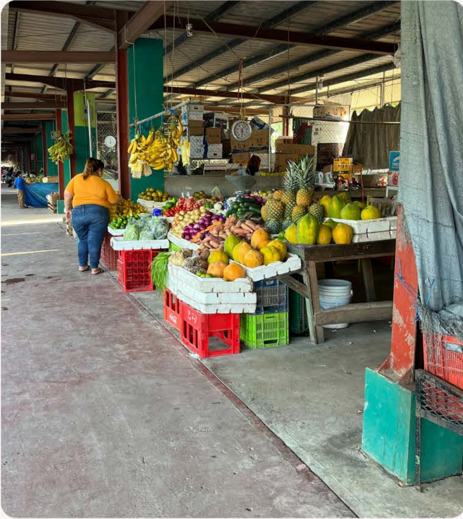
Market where we purchased our fresh produce.