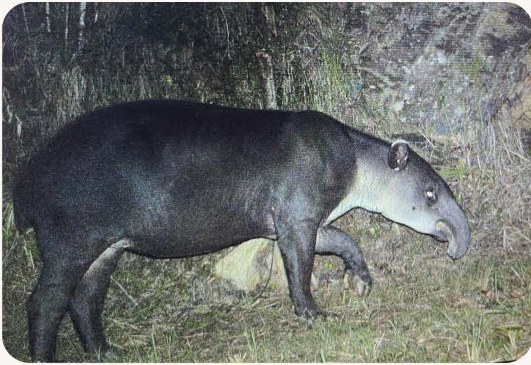
Tapir. The national animal of Belize