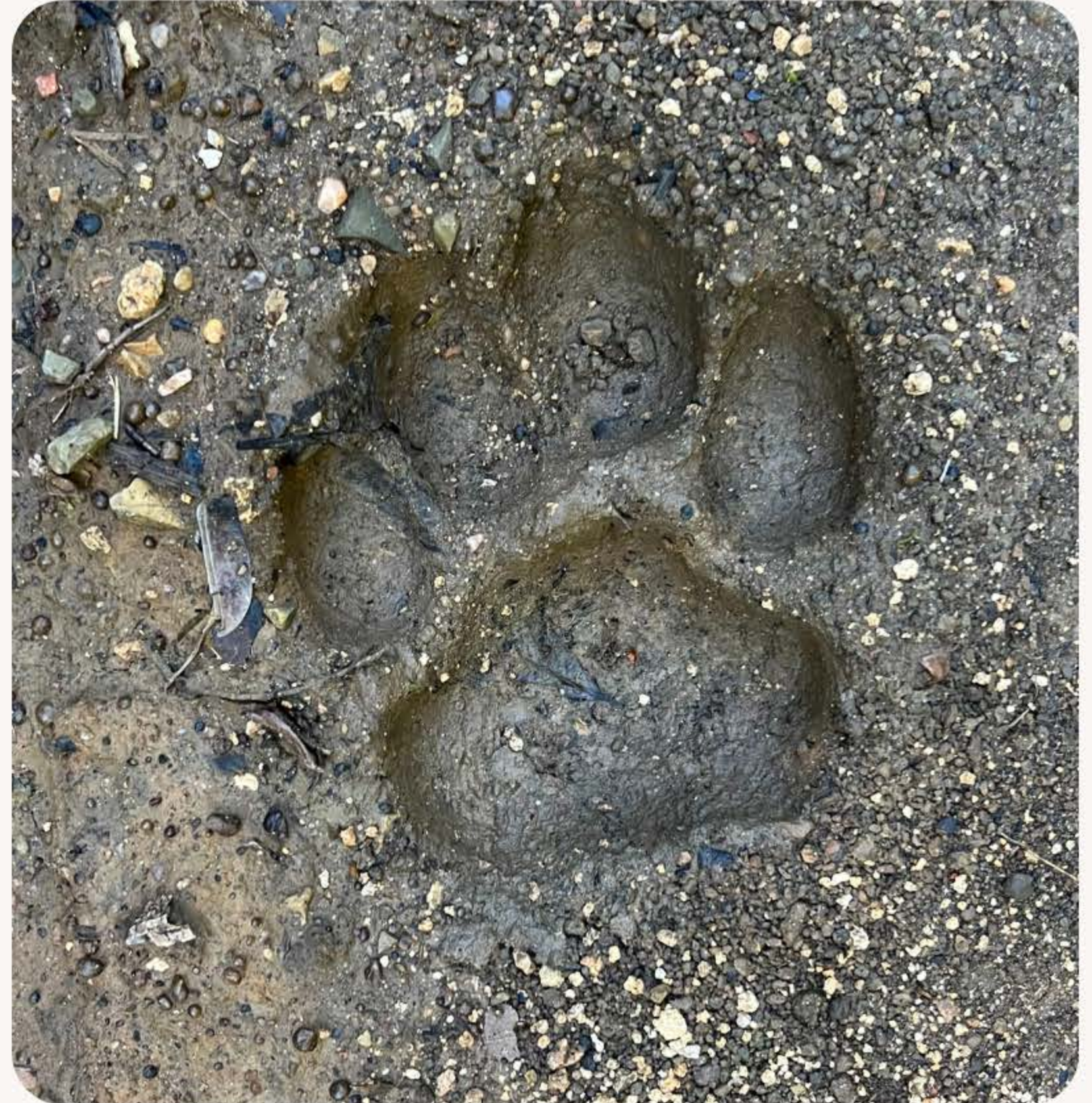
Fresh jaguar print on the trail