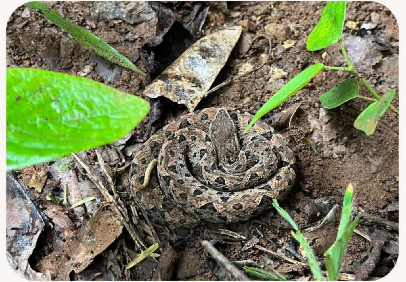
Fer-De-Lance. The most venomous snake in South and Central America. I found him on the trail