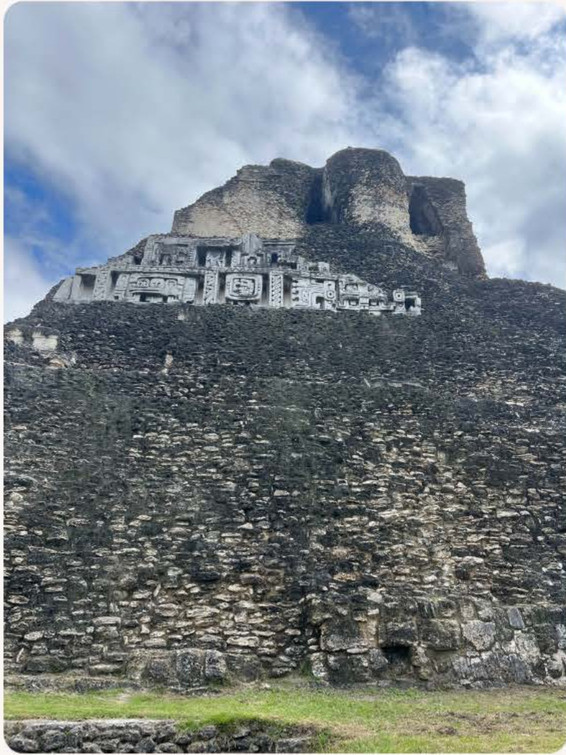
Xunantunich ancient Mayan Ruins that overlook Guatemala.

Beautiful Jaguars. The bottom photo was taken 2 hours after I set up the camera.