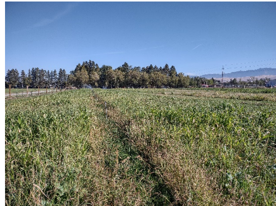
Figure 4. North end of perennial plots on September 14th