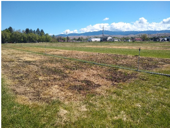
Figure 2. North end of perennial plots on May 26th