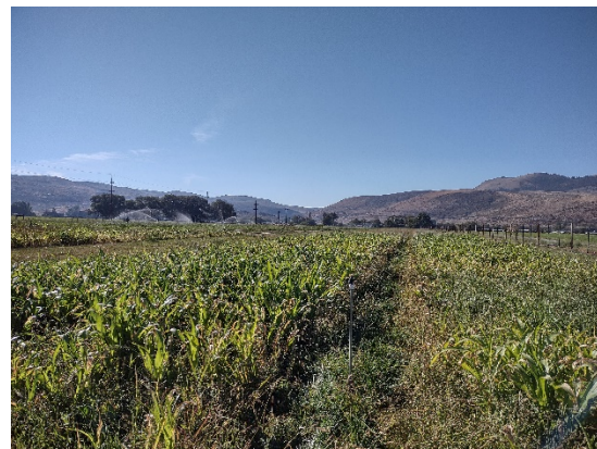
Figure 5. South end of perennial plots on September 14th