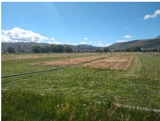
Figure 3. South end of perennial plots on May 26th