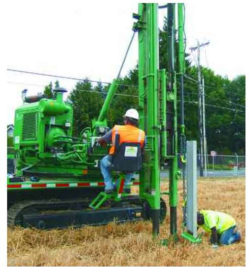
Solar City technicians performing geotechnical evaluations of soil strength for the engineering requirements of the solar array panels and their footings at NWREC.

Other challenges and delays have resulted from the land use permitting process and the concerns raised by neighbors who objected to the siting of the array.